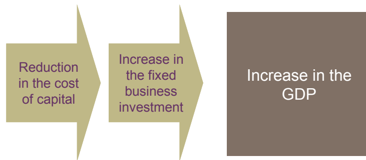
Figure 6.1 The impact of stamp duty

First, abolition of stamp duty would result in a reduction in the cost of capital of UK listed companies. Analysis in section 3 above summarises the results of the assessment of the reduction in the cost of capital of UK listed companies that would be likely to arise in the case of stamp duty abolition. Second, a reduction in the cost of capital of UK listed companies would be likely to result in increased fixed business investment. The evidence on the likely increases in the fixed business investment in the UK as a result of the stamp duty abolition is summarised in section 4. Third, an increase in the fixed business investment would be likely to result in an increase in the level of GDP in the UK. Finally, higher GDP would result in a higher tax-take by the UK government.