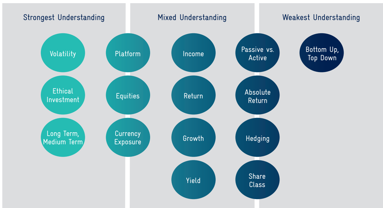
FIGURE 1: Fifteen regularly used investment terms presented to focus group participants

As part of the qualitative focus groups consumer testing, participants were presented with regularly used investment terms and showed varying degrees of understanding. Figure 1 highlights some of those terms by degree of how well understood these were: