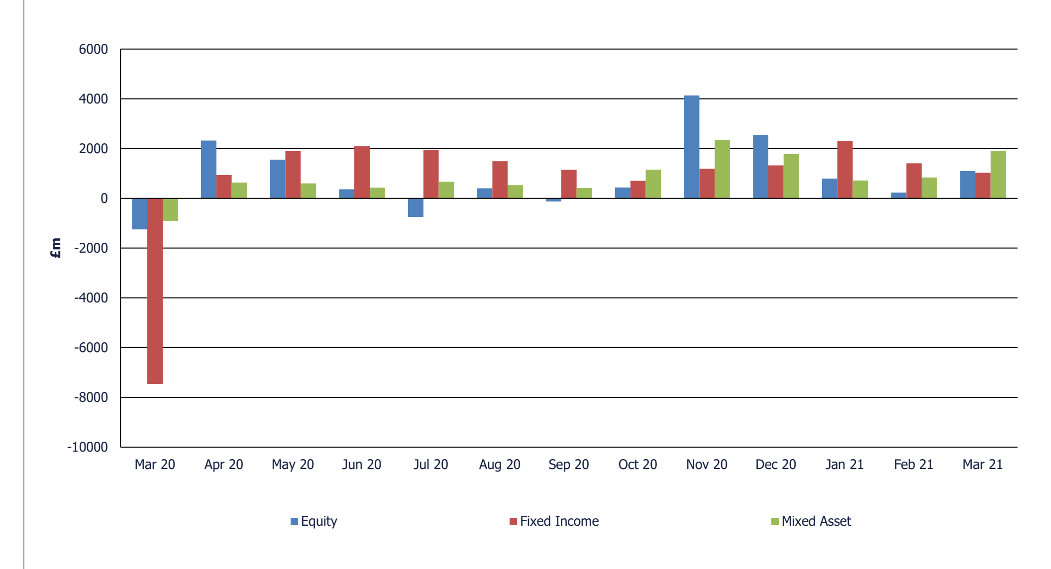
CHART B: NET RETAIL SALES BY ASSET CLASSES (UK DOMICILED FUNDS)