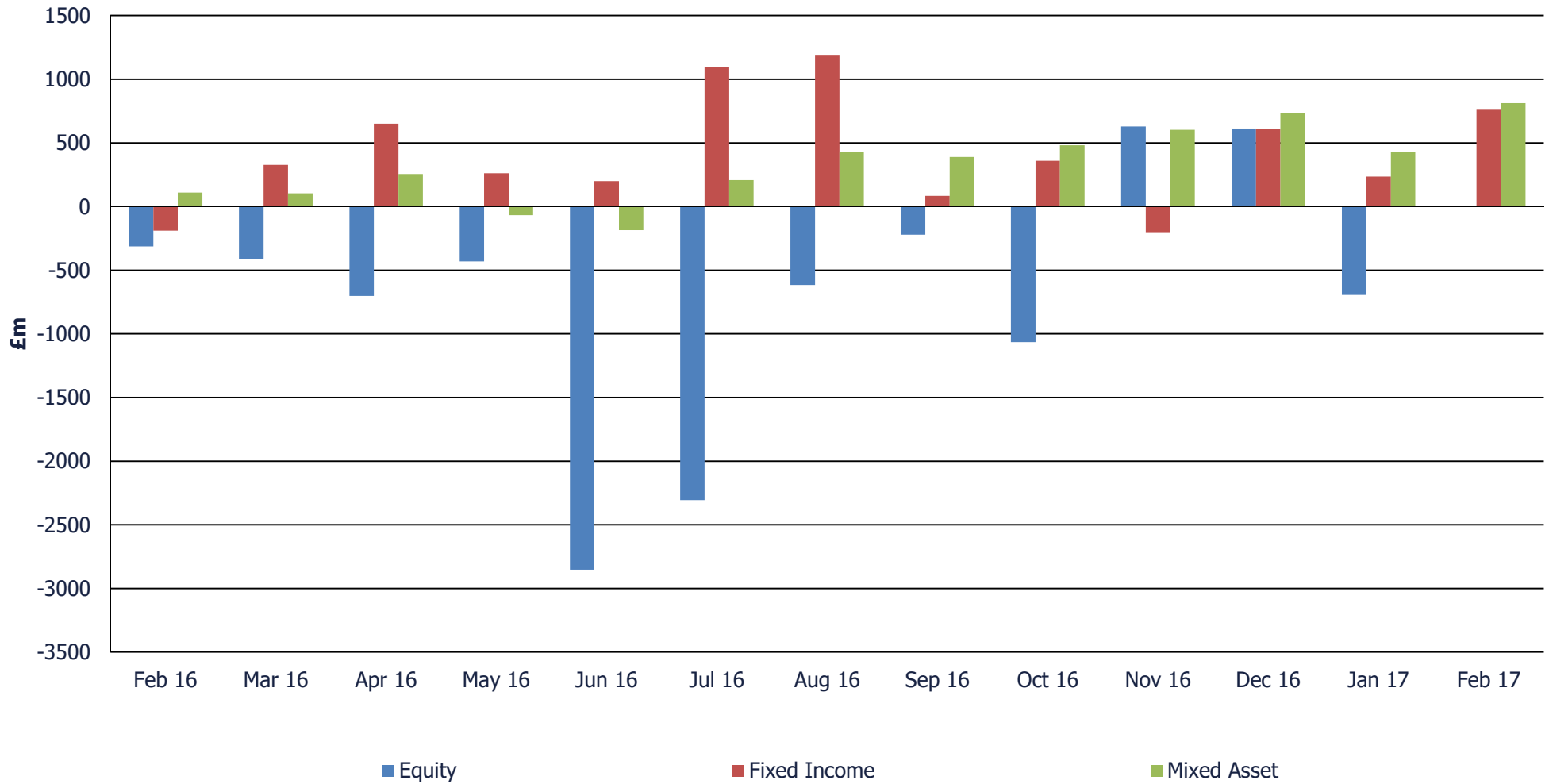
CHART B: NET RETAIL SALES BY ASSET CLASSES (UK DOMICILED FUNDS)