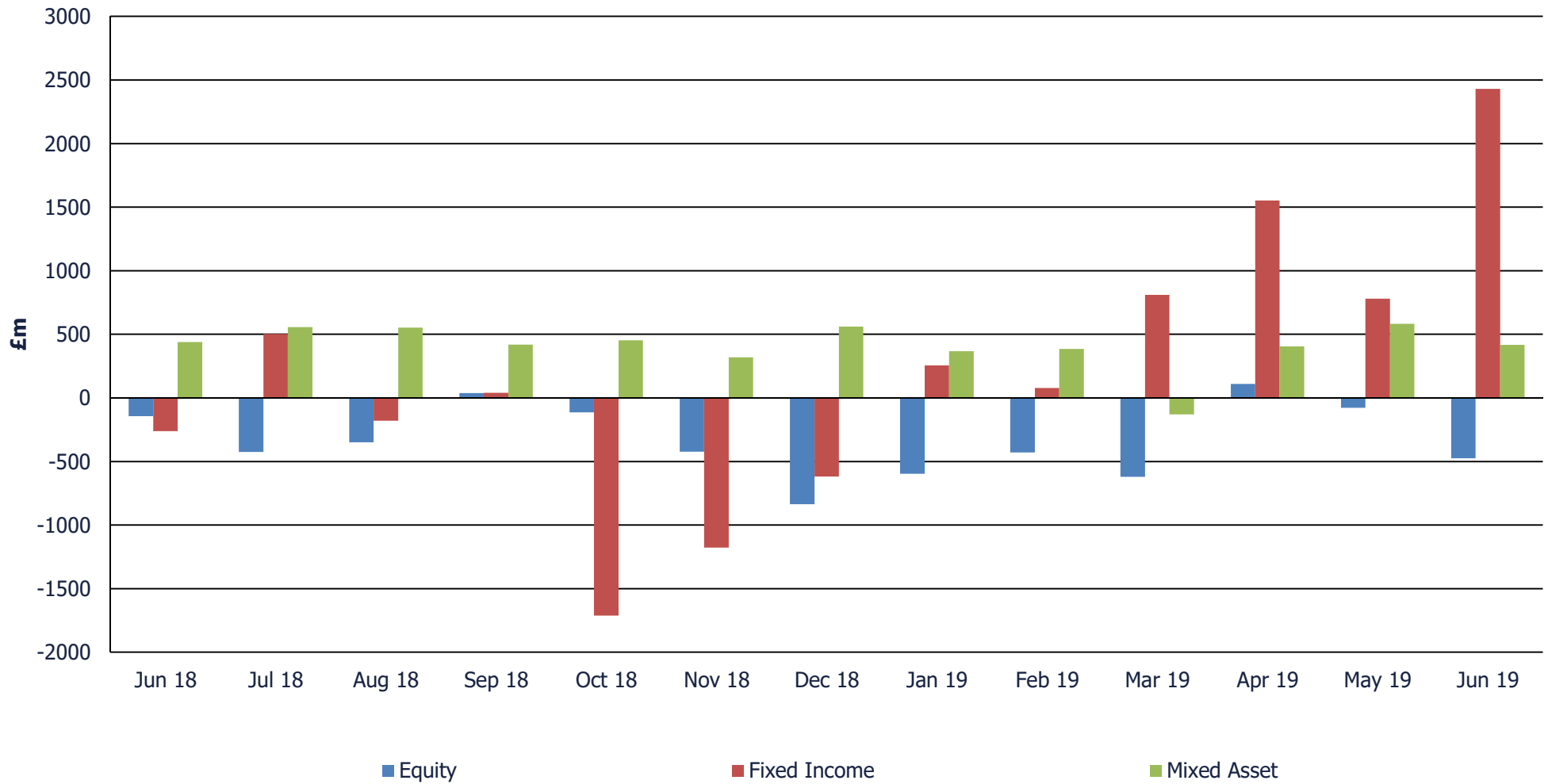
CHART B: NET RETAIL SALES BY ASSET CLASSES (UK DOMICILED FUNDS)