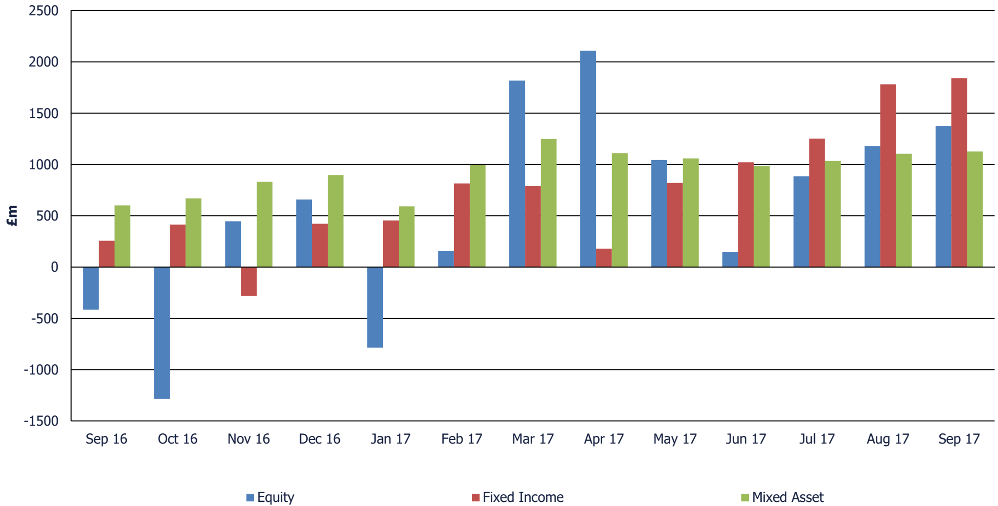
CHART B: NET RETAIL SALES BY ASSET CLASSES (UK DOMICILED FUNDS)