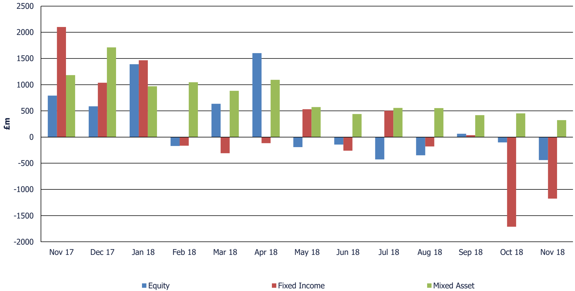
CHART B: NET RETAIL SALES BY ASSET CLASSES (UK DOMICILED FUNDS)